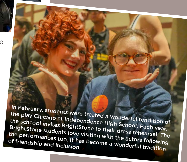
In February, students were treated a wonderful rendition of the play Chicago at Independence High School. Each year, the school invites BrightStone to their dress rehearsal. The BrightStone students love visiting with the actors following the performances too. It has become a wonderful tradition of friendship and inclusion.