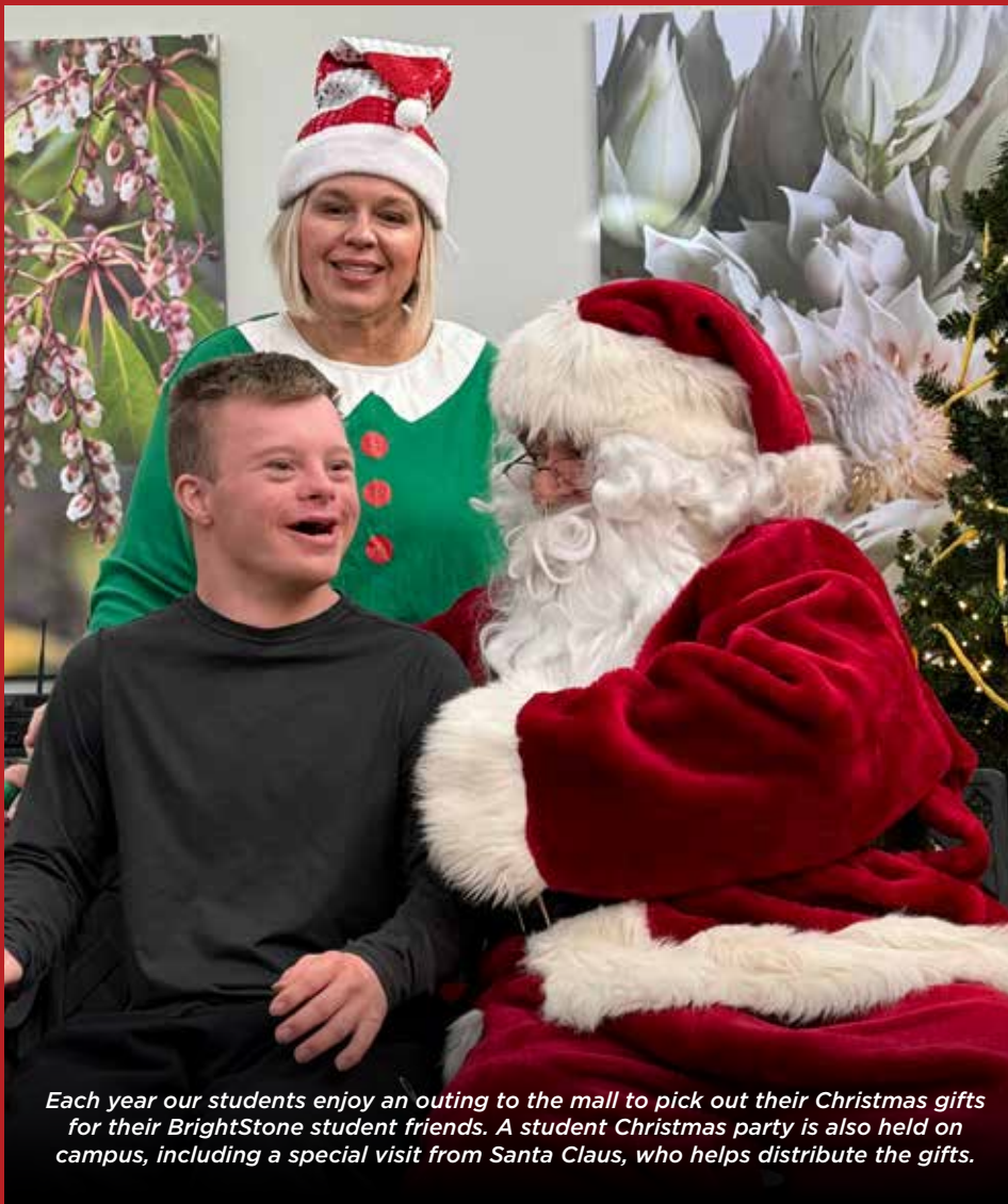
Each year our students enjoy an outing to the mall to pick out their Christmas gifts for their BrightStone student friends. A student Christmas party is also held on campus, including a special visit from Santa Claus, who helps distribute the gifts.