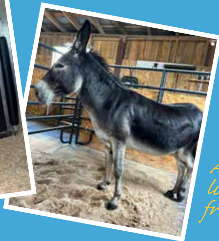
And 3 new little campus friends!